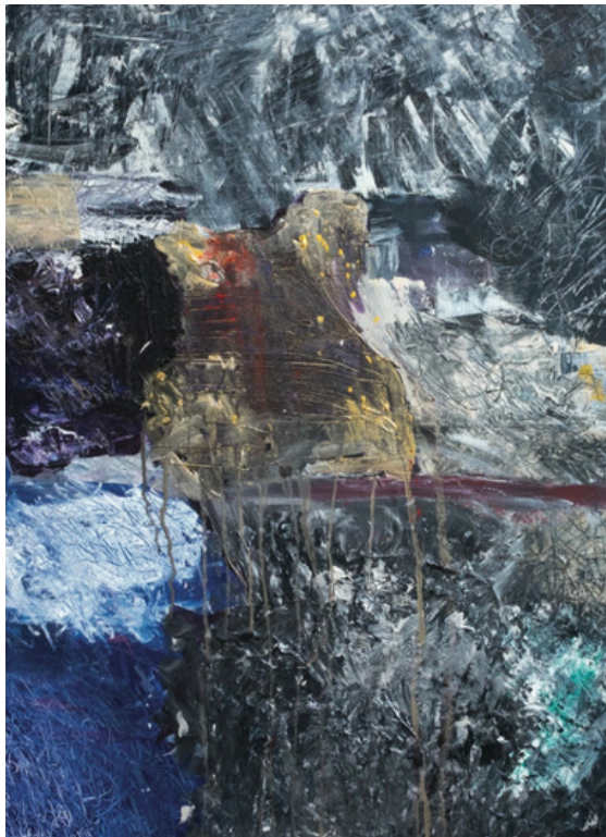
Wishing Well 2018 Mixed media 67 x 87 cm RM6,800