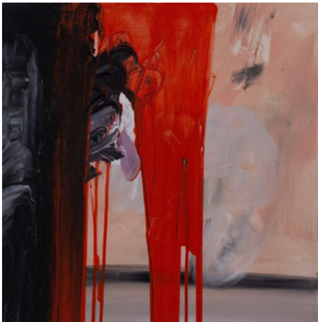
Her 2020 Acrylic on canvas 46 x 46 cm RM3,300