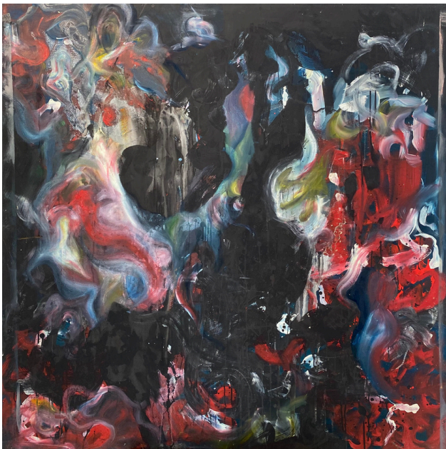
Bunga Api 2019 Oil on canvas 121 x 121 cm RM7,500