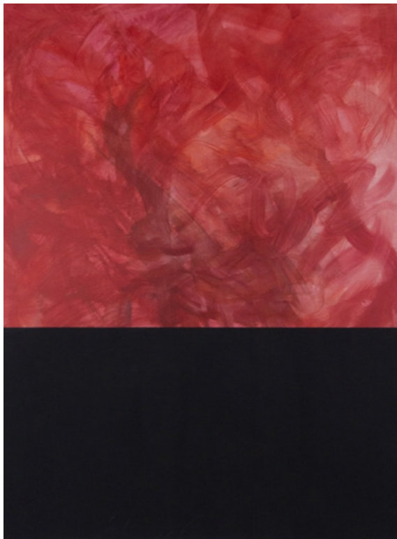
Halkum 2019 Acrylic on canvas 90 x 120 cm RM5,000