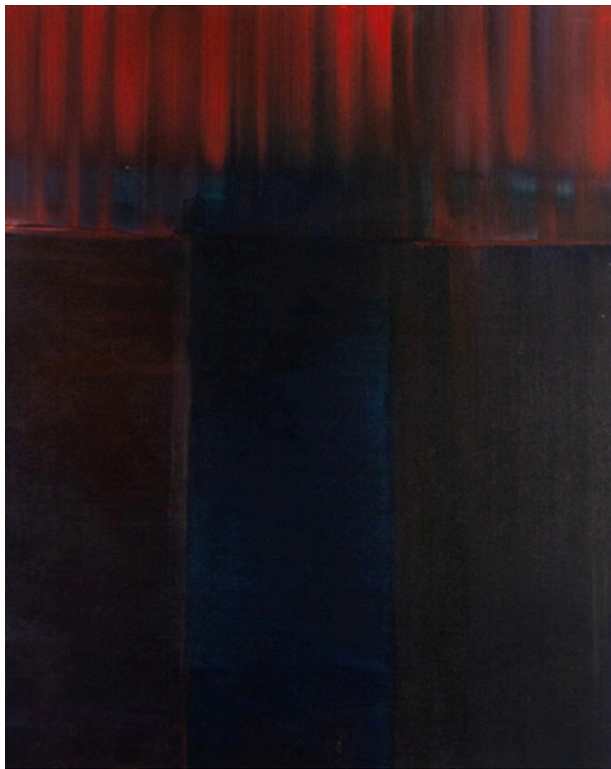
Romeo... 2020 Oil on canvas 60 x 76 cm RM6,500