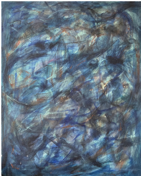
Water Picture 2020 40 x 50 cm Acrylic on canvas RM3,500